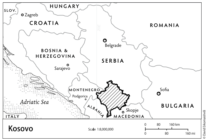
Peacekeeping & Jus Post Bellum

Boundaries of disputed territories reflect de facto status at the time of publication